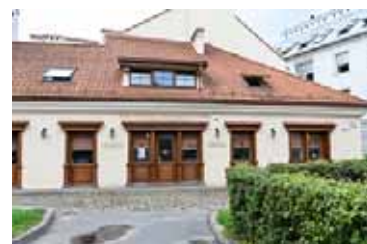
Location Jewish Culture & Information Center 23 Sept – 27 Oct 2013 12h – 19.h