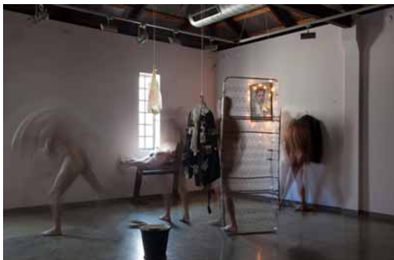
He who is no longer here (performance for Vilnius)

The confrontation of the living body with the absence of the missing body. This may be the essence of the search for personal traces and memories. A personal journey of each one of us through pictures of memory, a present-day confrontation with portraits of people whose body language at a specific moment in time is all that is left to remember them by.