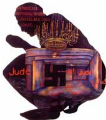
"Memory of the Holocaust Project" - I am contemporary artist, my paintings express my pain, the silent scream of mine. My soul is shocked, the brain can not understand how it was possible? These series of works were made from a personal need to preserve the memory of the Holocaust. My grandmother from my mother's side, has lost most of her family in the Holocaust. In many of my paintings and also in the video art work , my perspective is children, those little kids who had to go through the horror of the Holocaust. This reality is overwhelming and deeply has been etched in me, when I am watching movies documenting this period, since I was a little girl.