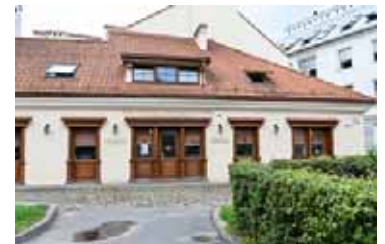
Location Jewish Culture & Information Center 23 Sept – 27 Oct 2013 12h – 19.h