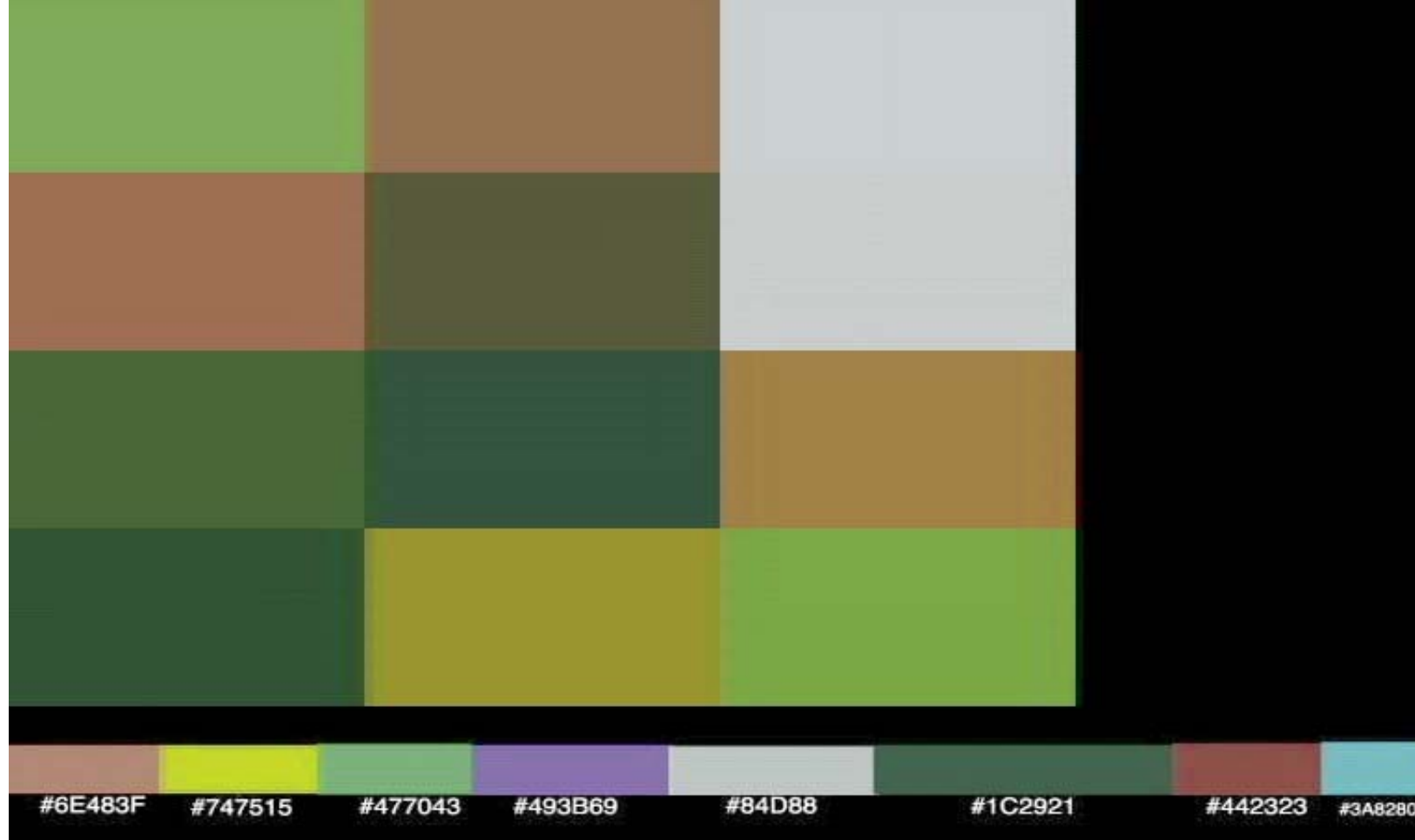
“Estructuras Cromáticas(Paisaje y Retrato)” , 2011, 2 :23 (Chromatic Structure - Landscape and Portait)

is a 21 year old art student, living in Pachuca Hidalgo, he is studying in Instituto de Artes (IdeA) of the Universidad Autónoma del Estado de Hidalgo (UAEH), he has been participated in different exhibitions of painting, drawing, and video. He participated in divers national festivals & exhibitions.