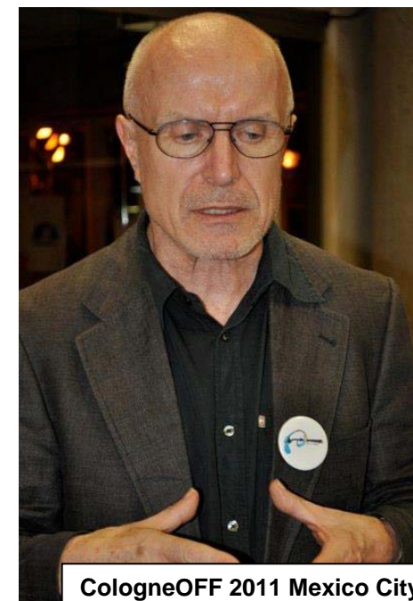
CologneOFF 2011 Mexico City – @ UAM – Universidad Autonoma Xochimilco – 14 November 2011 Agricola de Cologne