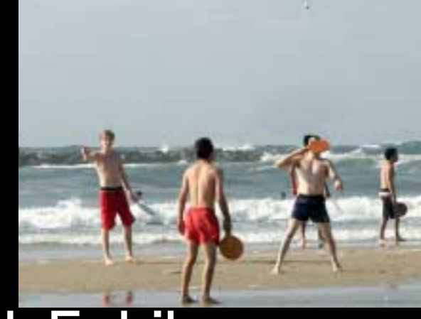
Hallo. Shalom. Salam. Videoland. Exhib.