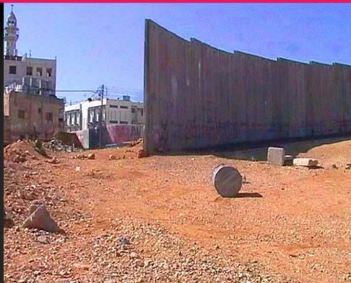
Susanne Wiegner (Germany) Home, Sweet Home!, 2014, 2:59

The film shows the immediate, destructive impact to a home by usual , everyday disturbances, that we create, watch and suffer at the same time.