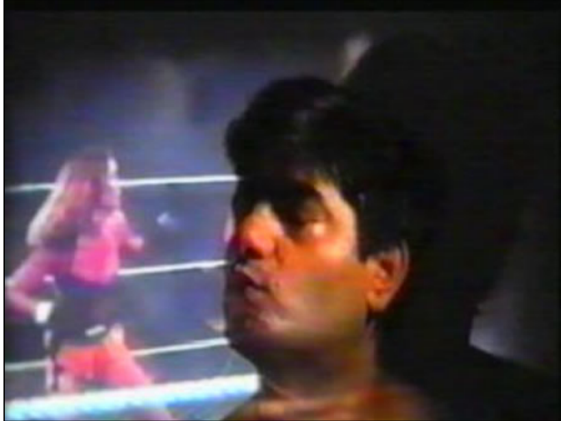
Sinasi Günes (Turkey)