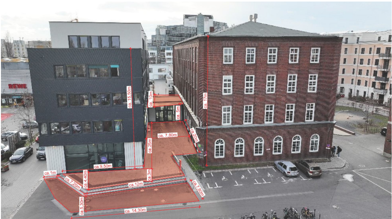
Diagram with approximate dimensions